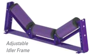
Adjustable Idler Frame