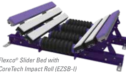
Flexco® Slider Bed with CoreTech Impact Roll (EZSB-I)