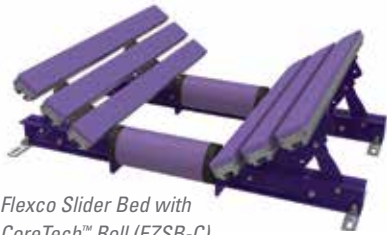
Flexco Slider Bed with CoreTech™ Roll (EZSB-C)