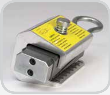
Large impact plate provides easy striking surface.