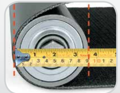
Measure smallest pulley diameter.