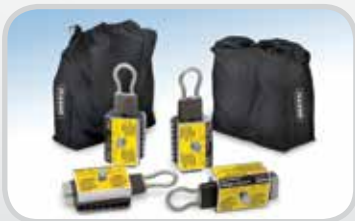
Smart Clamp™ Belt Clamps