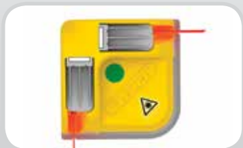
Laser Belt Square