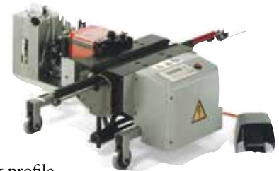
Shown: Pro 6000

Pro Series production lacers feature our patented jaw action – the comb, hooks and belt are simultaneously pulled down as the jaws compress the hooks into the belt, forming an optimal hook profile.