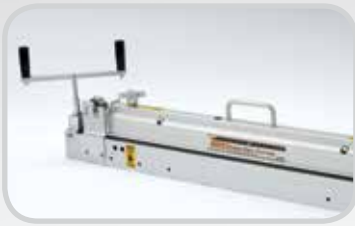
900 Series Belt Cutter

Carbide cuts belt impression cover for quick and clean skiving. Attaches to a 10 mm (3/8") electric or pneumatic drill (2,500 rpm).