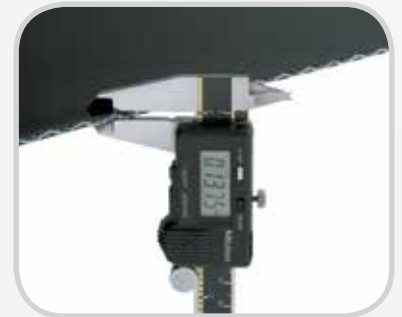
Measure belt thickness.