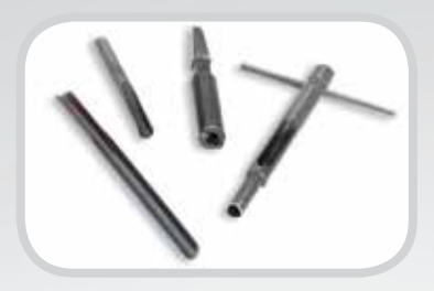
Hand installation tools