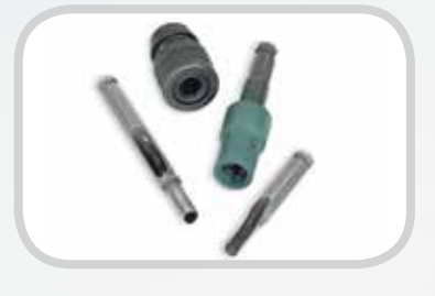
Power installation tools