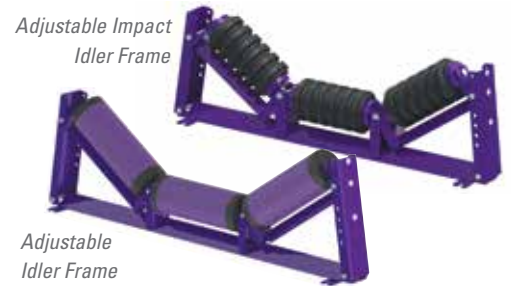
Adjustable Impact Idler Frame