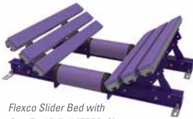
Flexco Slider Bed with CoreTech™ Roll (EZSB-C)