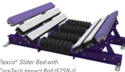
Flexco® Slider Bed with CoreTech Impact Roll (EZSB-I)