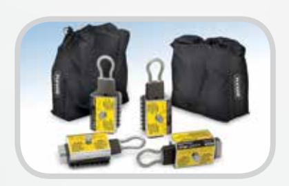
Smart Clamp<sup>™</sup> Belt Clamps