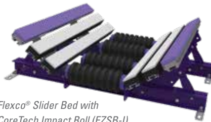
Flexco® Slider Bed with CoreTech Impact Roll (EZSB-I)