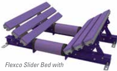
Flexco Slider Bed with CoreTech™ Roll (EZSB-C)