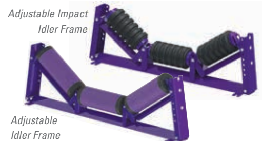
Adjustable Impact Idler Frame