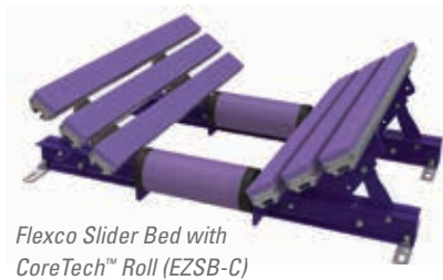
Flexco Slider Bed with CoreTech™ Roll (EZSB-C)