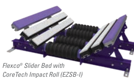
Flexco® Slider Bed with CoreTech Impact Roll (EZSB-I)