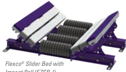
Flexco® Slider Bed with Impact Roll (EZSB-I)