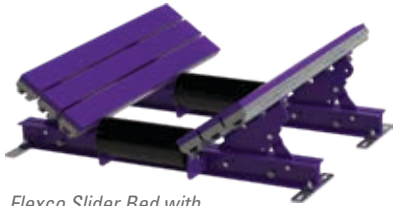
Flexco Slider Bed with Standard Roll (EZSB-C)