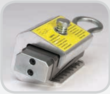
Large impact plate provides easy striking surface.