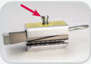
Return Spring Post holds wedges up so belt can easily slide into clamping position.