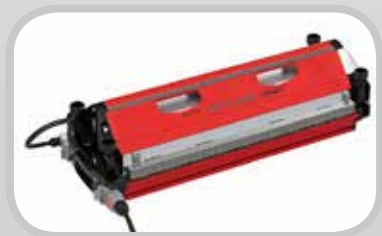
Novitool® Belt Fabrication Tools