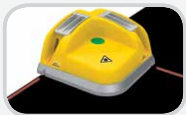
Laser Belt Square