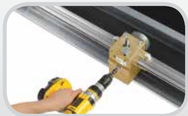
Clipper® Wire Hook Fastening Systems