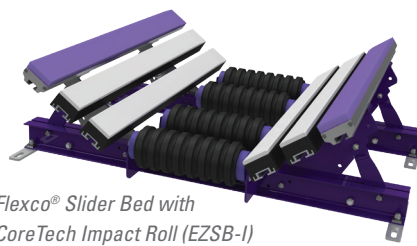
Flexco® Slider Bed with CoreTech Impact Roll (EZSB-I)