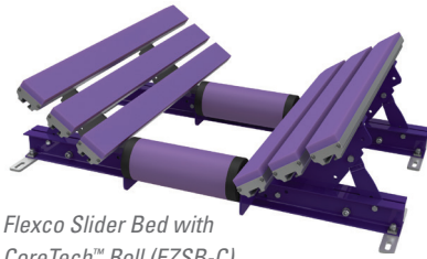
Flexco Slider Bed with CoreTech™ Roll (EZSB-C)