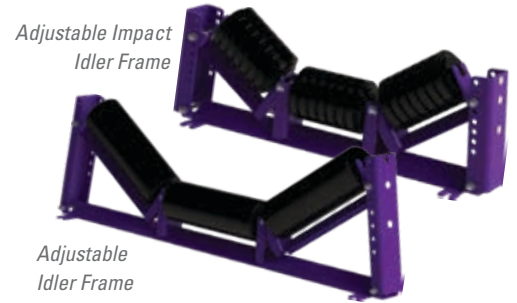
Adjustable Impact Idler Frame