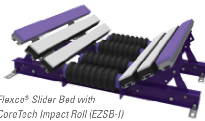
Flexco® Slider Bed with CoreTech Impact Roll (EZSB-I)