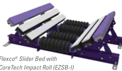
Flexco® Slider Bed with CoreTech Impact Roll (EZSB-I)