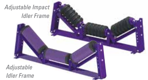
Adjustable Impact Idler Frame