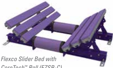
Flexco Slider Bed with CoreTech™ Roll (EZSB-C)