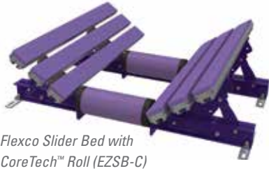
Flexco Slider Bed with CoreTech™ Roll (EZSB-C)