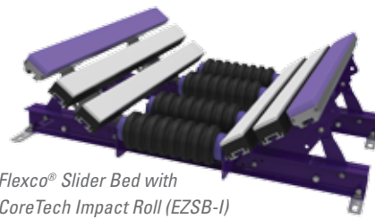
Flexco® Slider Bed with CoreTech Impact Roll (EZSB-I)