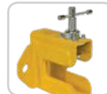
Clamp Ends feature increased capacity for easier clamp bar insertion and weigh less than 13 kg each