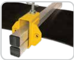
Clamps over the belt for greater strength

Flexco understands that worker safety is a top priority when repairing belts carrying larger loads. Flexco TUG™ HD® Belt Clamps are designed to secure the belt for belt repair meeting the most stringent safety test standards. Available in 6 and 8 tonne versions, TUG HD Belt Clamps provide even tensioning across the entire belt width for ultimate strength. Modular components allow for increased versatility and portability.