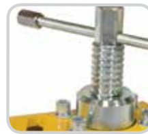
Acme thread offers superior grip strength and allow operators the chance to slowly release the belt after maintenance