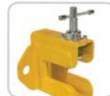
Clamp Ends feature increased capacity for easier clamp bar insertion