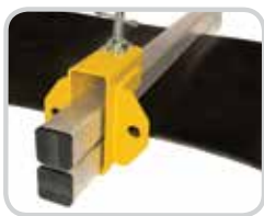
Clamps over the belt for greater strength

Flexco understands that worker safety is a top priority when repairing belts carrying larger loads. Flexco TUG™ HD® Belt Clamps are designed to secure the belt for belt repair meeting the most stringent safety test standards. Available in 6 and 8 ton versions, TUG HD Belt Clamps provide even tensioning across the entire belt width for ultimate strength. Modular components allow for increased versatility and portability.