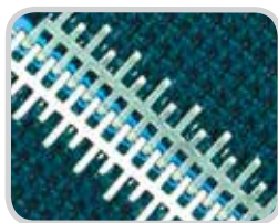
Flat, Low-Profile splice is ideal for applications with slider beds

Anker® G Series Lacing stamped from either galvanized or AISI 316 stainless steel and then machine-applied for consistent compression, resulting in a uniform and flat splice. G Series lacing features, as an option, a staggered-leg design with four alternating leg lengths. These varying points of belt penetration provide additional strength and durability for the finished splice. Ideal for use in food manufacturing, package and parts handling, and filter media, the Anker® G Series is designed for use with PVC, PU, and PES belting.