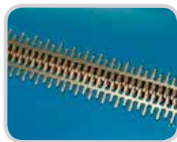
Precision Stamping ensures a consistent 4.00 mm pitch over the entire length of the lacing for easier machine installation