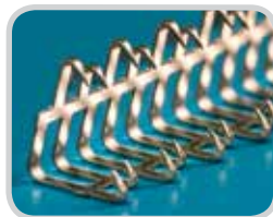
Staggered Leg Geometry increases the strength and durability of the splice