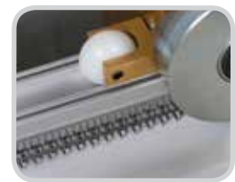
Anker ® maintenance lacers quick, on-site installation of G Series™ lacing with precision Roller Lacing Technology™