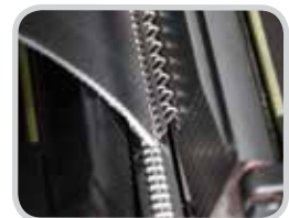
Anker ® production lacers the quickest, most precise method for high-volume installation of G Series™ lacing