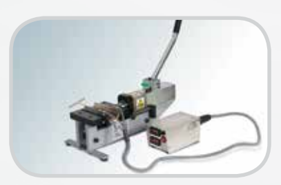
The AHP-120-WNP offers a manual, yet quick, method for installing the patch fasteners. Lacer includes both a heating/pressing station and a cooling station.