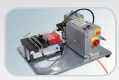
The electric hydraulic ARK-150-WNP offers the quickest and easiest methodology for installing the patch fasteners. Lacer includes both a heating/pressing station and a cooling station.