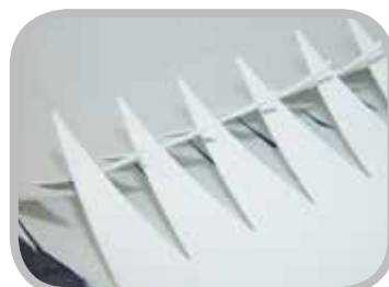
Punches precise fingers