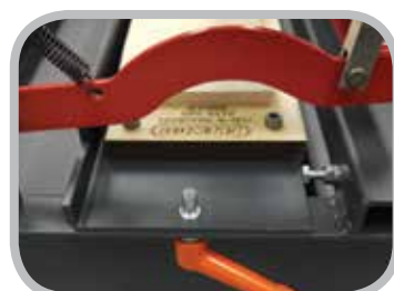
Easy positioning and clamping

Flexco Europe GmbH • Leidringer Strasse 40-42 • D-72348 Rosenfeld • Deutschland Tel: +49-7428-9406-0 • Fax: +49-7428-9406-260 • E-mail: europe@flexco.com