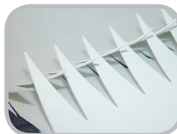
Punches precise fingers