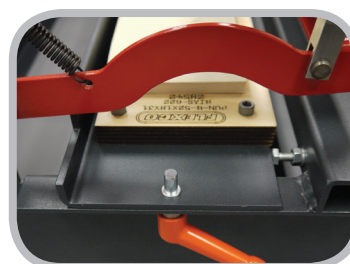
Easy positioning and clamping

Flexco Europe GmbH • Leidringer Strasse 40-42 • D-72348 Rosenfeld • Germany Tel: +49-7428-9406-0 • Fax: +49-7428-9406-260 • E-mail: europe@flexco.com