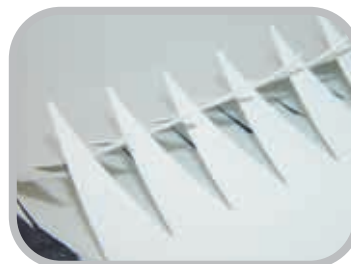
Punches precise fingers