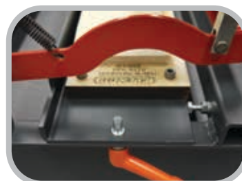
Easy positioning and clamping