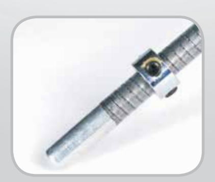
Hinge Pin Retaining Collars hold hinge pin in place to prevent "pin migration."