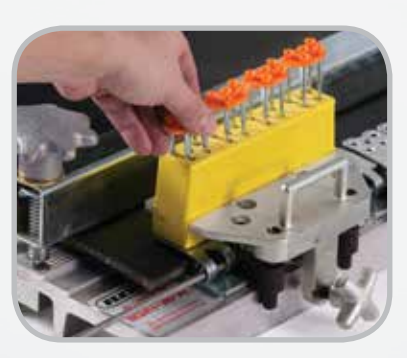
Unique Flexco Rapid Loader™ Collated rivet strips make it easy to load 20 rivets into your multiple guide block at one time and eliminate time consuming handling of individual rivets.