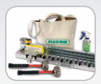
Easy-to-use, portable tool makes multiple rivet driving simple and fast. The MSRT Multiple Rivet Driving Tool is made of lightweight aluminum.