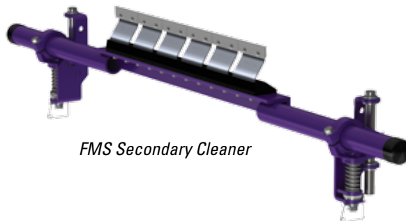
FMS Secondary Cleaner