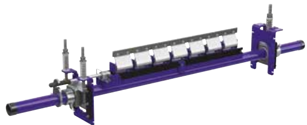
MHS Enhanced Service Advantage Cartridge Heavy-Duty Secondary Cleaner