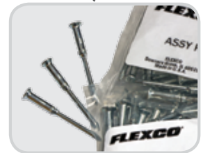
Required Rivets Kits include individual self-setting SR rivets that provide maximum resistance to pull-out.