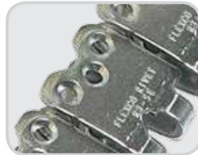
Fastener Strips Each Splice Kit contains 2 fastener strips. Order by belt width.

The Flexco® SR™ Rivet Hinged Fastening System has earned a reputation for quality and performance in the most demanding material handling applications. That same quality and performance is now available in single splice packaging – everything you need for a single splice in one convenient kit.