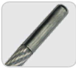
Hinge Pin Splice Kits contain one hinge pin cut to belt width in either NC Nylon Covered Steel Cable or AC/AC6 Bare Armored Cable.