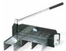
14" Belt Cutter