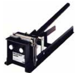
Baler Belt Lacer