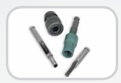
Power installation tools