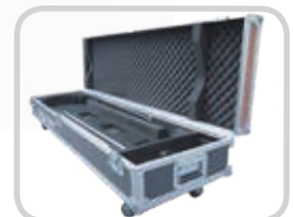
Custom Transport Case for easy storage and transportation