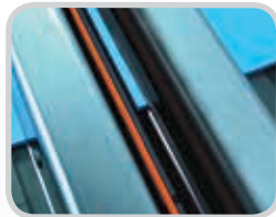
Contactless Heating provides for a controlled amount of clash without actual contact with the heat source