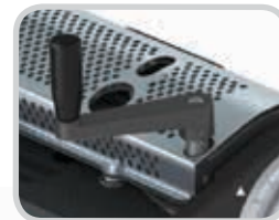
Shielded Heat Zone and Temperature Control ensures splice parameter consistency regardless of ambient temperatures