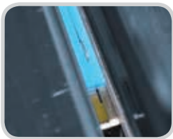
Integrated Belt Cutter maintains accurate pitch in a single pass

Custom templates secure the belt when cut to ensure accurate pitch control. Then the contactless heating process splices the belt in less than one minute and finishes with a controlled amount of clash. To ensure quality splices, pinholes are avoided through engineered solutions such as the pre-heat function to remove moisture from the belt ends; the shielded heat zone for consistent heating in various environmental conditions; and the contactless heating method. Accuracy, speed, and operator safety are fully integrated into the Amigo design making it an ideal splicing tool for in-shop or on-site splicing.