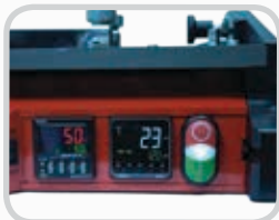
Digital Time Control with quick, simple splice settings; the Pre-Heat Setting can be used to remove moisture and avoid pinholes