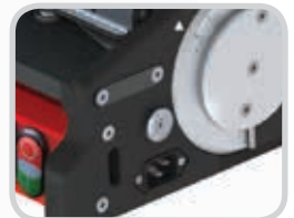
Operates on Single Phase 115V or 230V