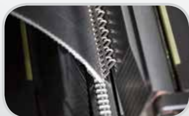
Clipper® production lacers — the quickest, most precise method for high-volume installation of G Series™ lacing