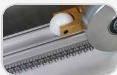
Clipper® maintenance lacers — quick, on-site installation of G Series™ lacing with precision Roller Lacing Technology™