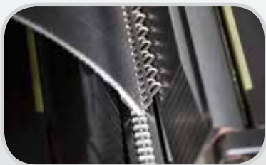
Clipper® production lacers — the quickest, most precise method for high-volume installation of G Series™ lacing