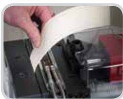
Built-in cooling station insures proper bonding of the patch material with the laundry tape