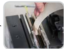
Heated jaws activate the glue during the quick installation process