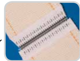
Fastener points are covered by the patch during installation