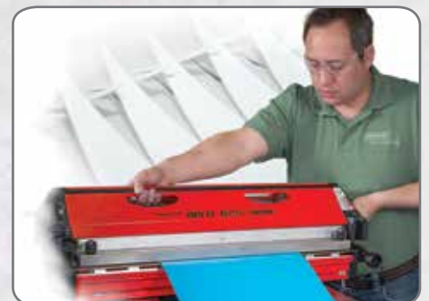
Novitool® Aero® Portable Splice Press Easy to operate and excellent splice repeatability

For splicing, we offer two types of solutions: mechanical belt fastening and endless splicing (sometimes called vulcanizing). Both can be used with light-duty conveyor belts, and both create reliable, sanitary splices you can trust to perform.