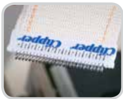
Custom patch logos available