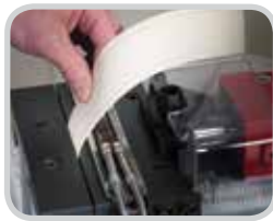
Built-in cooling station insures proper bonding of the patch material with the laundry tape