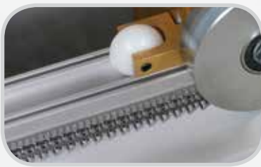
Clipper® maintenance lacers — quick, on-site installation of G Series™ lacing with precision Roller Lacing Technology™