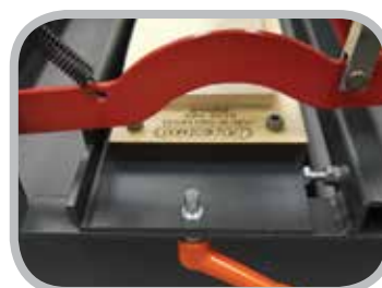
Easy positioning and clamping

Unit 7 Kingsmark Freeway • Oakenshaw • Bradford, BD12 7HW • United Kingdom Tel: +44-1274-600-942 • Fax: +44-1274-673-644 • Email: sales@flexco.co.uk