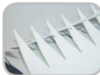
Punches precise fingers