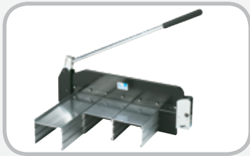
14" Belt Cutter