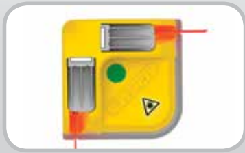
Laser Belt Square