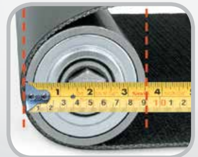
Measure smallest pulley diameter.