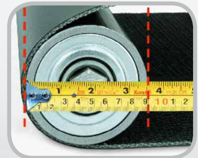
Measure smallest pulley diameter.