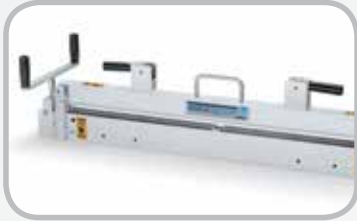
845LD Belt Cutter