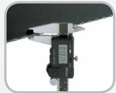
Measure belt thickness.