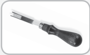
Rough Top Belt Skiver