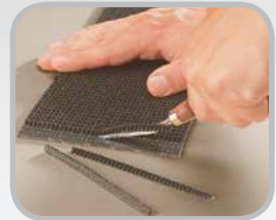
Skive impression cover.