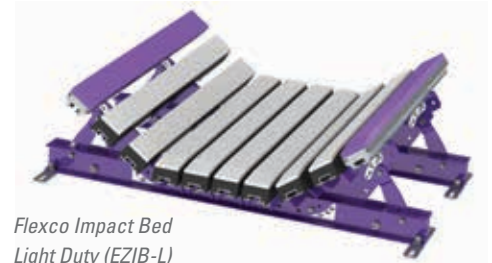
Flexco Impact Bed Light Duty (EZIB-L)