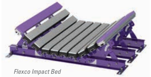
Flexco Impact Bed Medium Duty (EZIB-M)