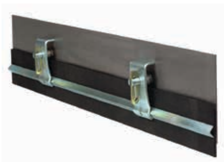
RMC1 Skirt Clamp (Standard)

Skirt Rubber Thickness Ranges: 8mm to 19mm (5/16" to 3/4").