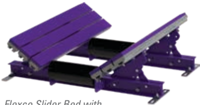
Flexco Slider Bed with Standard Roll (EZSB-C)