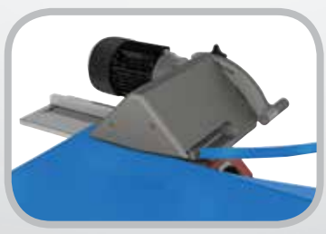
Optional Step Cutter

The Optional Step Cutter efficiently prepares belts for stepped splices or recessed mechanical splices. The top ply is quickly removed with a simultaneous vertical and horizontal cut.