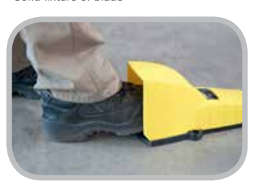
Foot pedal for two-handed operation