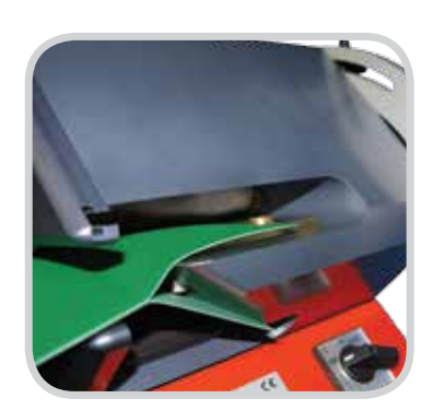
Separate between the plies

The Ply 130™ is used to separate between the plies of a conveyor belt. This cutting action is often required in preparation before splicing a belt with a splice press. A great advantage of this ply separator is that it can split as deep as 130 mm (5") in one action. This is especially helpful when splitting very thin belts or belts where the material is difficult to cut, like with thin polyurethane belts. The Ply 130 is an excellent tool for preparing stepped splices and for recessing mechanical fasteners.