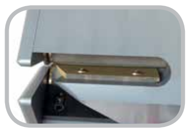
Solid fixture of blade