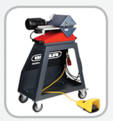
Optional Ply 130 Cart *optimal cutting height of 39" (960 mm)

The Ply Cart provides a convenient method of using the Ply 130 throughout the light-duty workshop. It is no longer necessary to custombuild carts or purchase utility carts, which are not optimal for ply separator transport. Previously-purchased Ply 130 units are easily mounted onto the cart using a retrofit tray.