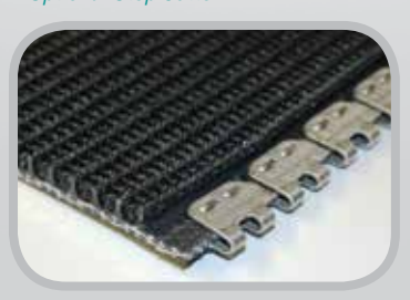
Easily prepare belt ends for recessed fastener installation.