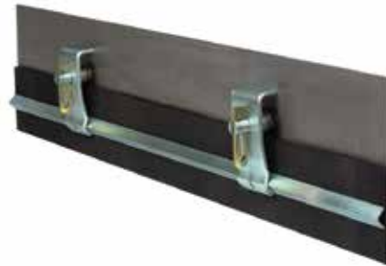
RMC1 Skirt Clamp (Standard)

* Includes two clamp plates (Standard or LS- Limited Space) two clamp pins, and one 4' (1.2M) clamp bar. Skirt board and rubber not included. Skirt Rubber Thickness Ranges: 5/16" to 3/4" (8mm to 19mm).