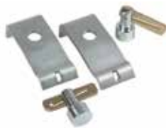
PAL PAK (Standard)