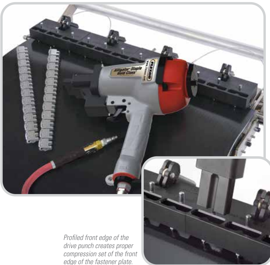
Profiled front edge of the drive punch creates proper compression set of the front edge of the fastener plate.