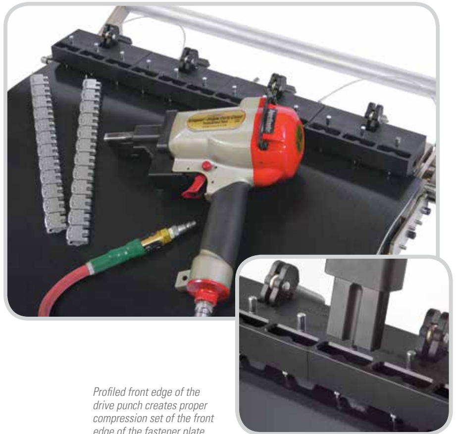
Profiled front edge of the drive punch creates proper compression set of the front edge of the fastener plate.