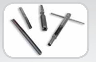
Hand installation tools